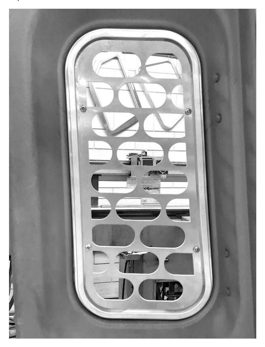
Figuur 1 Quarter window with inner lining.

Most Land Rover Defenders are finished on the inside with a plastic lining. The Explore Glazing Quarter window is therefore approximately 8 mm smaller than the hole in the bodywork. After installation of the Quarter window, the inner lining will fit perfectly.